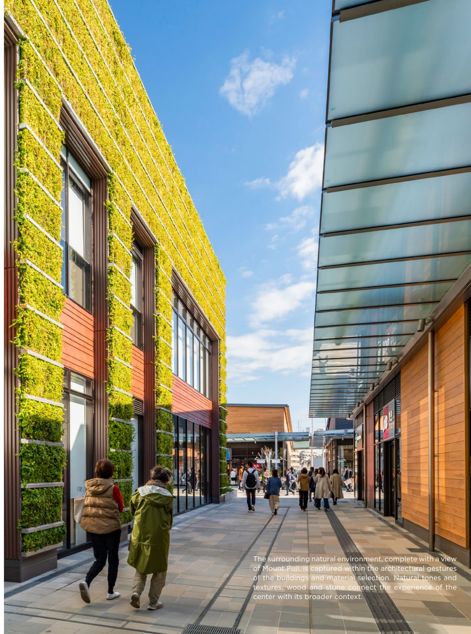
The surrounding natural environment, complete with a view of Mount Fuji, is captured within the architectural gestures of the buildings and material selection. Natural tones and textures, wood and stone connect the experience of the center with its broader context.