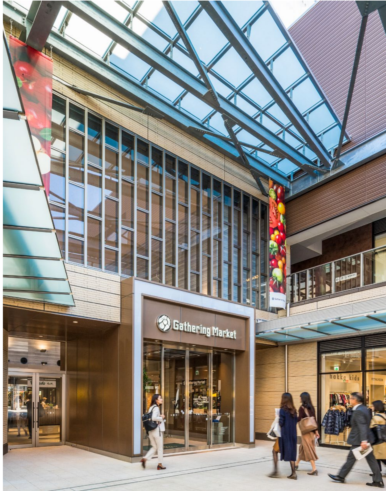
Located in the center of the village, and cutting through the parking structure, the Gathering Market is food hall with restaurants offering fresh vegetables, meats, and fish.